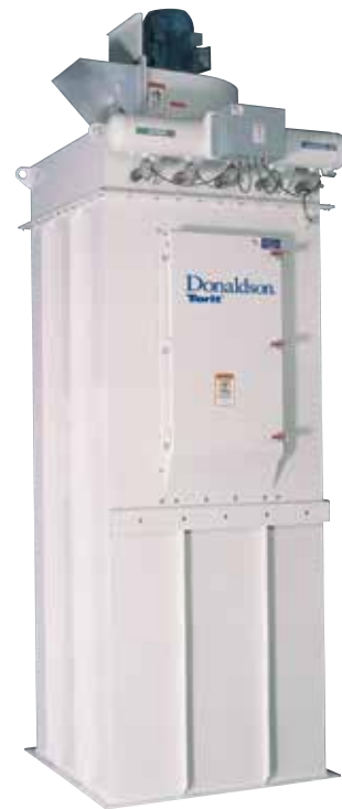
25FS8 Bin Vent with integrated fan

Economical solutions for dust collection and bin venting applications.