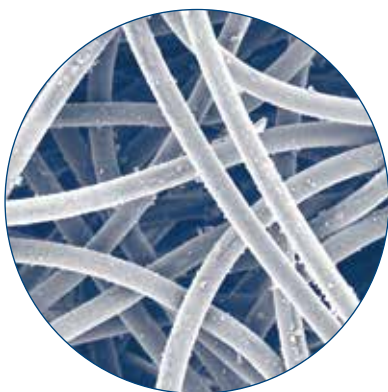
Dura-Life™ Bag-Clean Air Side (300x)