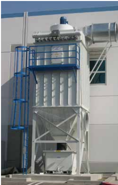
121FS10 Pulse Jet Baghouse Dust Collector with integrated fan, silencer and dumpster discharge