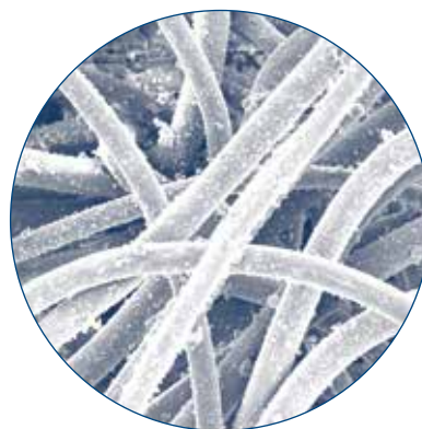
Polyester Bag-Clean Air Side (300x)

These photos were taken with a scanning electron microscope of bag media used in a collector that was filtering fly ash. The bags were removed after 2,700 hours of use. Air-to-media ratio was 4.5 to 1. Pressure drop after 2,700 hours of operation was 6 inches (152.4 millimeters) on polyester bags and 2 inches (50.8 millimeters) on Dura-Life™.